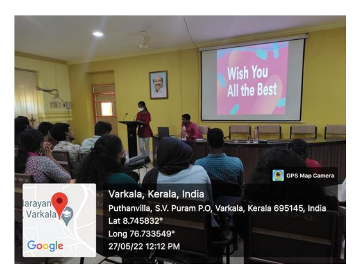
Vote of Thanks