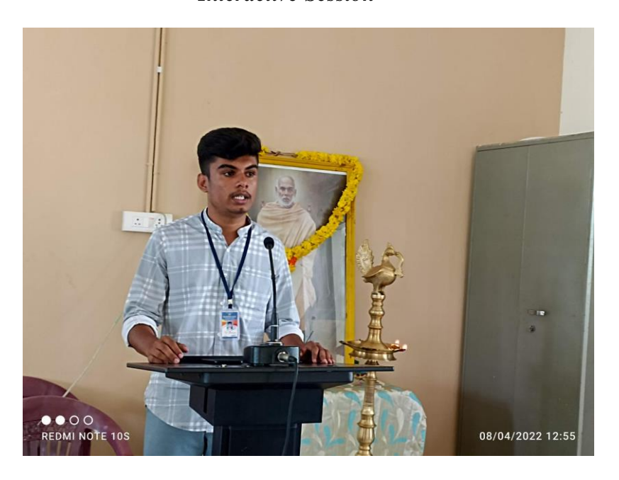
Vote of Thanks